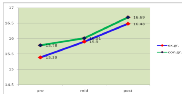
Fig 2: Body mass index

The increase of body weight may be attributed to the decrease of body fat and increase of body mass. The data about this matter was incorporated in the health related physical fitness area of this work. Very similar result was found by the other researchers (Kristal, 2005, and Chen, 2009) [16]. The body mass index was calculated from the body weight and height. It was observed that the BMI was improved significantly (P<0.001). The BMI was increased by 3.31% after 6 weeks and 7.08% after 12 weeks, whereas there were very slight changes in the control group in the time of experiment (Figure no. 2 and Table no. 2).