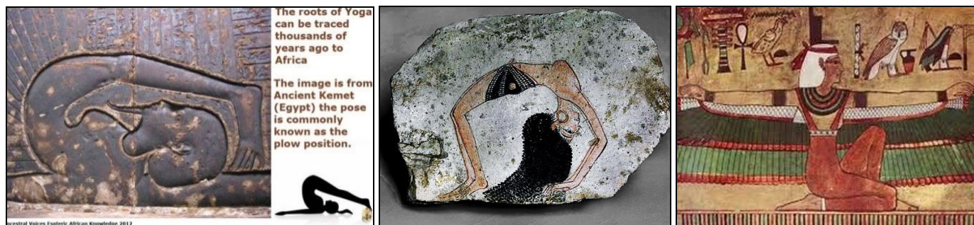
Fig 2: Ancient Egyptian Artifacts (Egyptian Pottery, 2009)