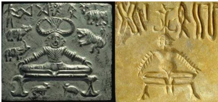
Fig 1: A number of seals and fossil remains of Indus Saraswati valley civilization with Yotic motives and figures performing yoga indicate the presence of Yoga in India (D. I. V. Basavaraddi, 2015) [3].

In the yogic teachings, Shiva is considered as the first Yogi or Adiyogi, and the first Guru or Adi Guru (Basavaraddi, 2015) [3]. On the basis of excavations Mohenjo-daro in the 1920s and 1930s gave evidence "Proto-Siva" seals among many revelations of Mohenjo-daro to Marshall to conclude that, "nothing is more significant than the discovery that Saivism has a history of five thousand years or perhaps even earlier and therefore it is the longest living faith in the world" (Dhyansky, 1987) [12].