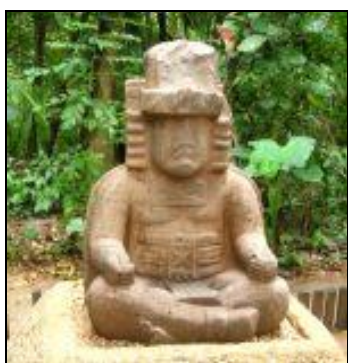
Fig 4: An Olmec stone statue seated in a cross-legged yogic position called Sukhasana (Pinterest, 2018).

Misra (2017) [27] claimed that specific Yoga asanas were depicted in numerous figurines from Central America attributed to the Olmec civilization (1500 BC to 400 BC, with cultural connections stretching back as early as 2500 BC according to some scholars) and to the Western Mexico shaft tomb culture from the region of modern-day Jalisco, Nayarit and Colima (generally dated to the period 400 BC to AD 300, but with evidence of activity which also stretches back to 1500 BC). He identified the above artifacts from Colima, as demonstrating the Vrschikasana or Scorpion asana.